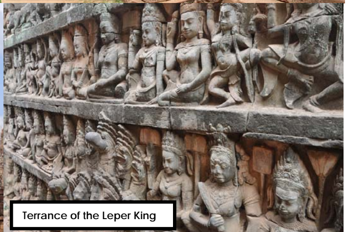
Terrance of the Leper King