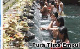
Pura Tirta Empul