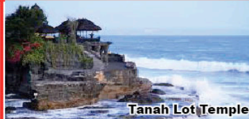
Tanah Lot Temple

Sequences of Itinerary are subject to local arrangement.