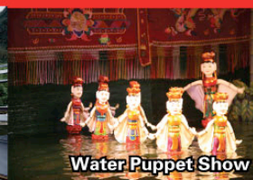
Water Puppet Show