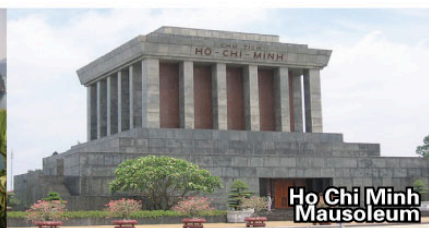
Ho Chi Minh Mausoleum

Optional Tour: • Buggy (Included Tips) [USD 8] • Halong Bay Speed Boat + Small Boat Cruise to Tunnel [USD 32]