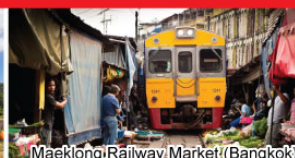
Maeklong Railway Market (Bangkok)