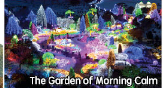
The Garden of Morning Calm