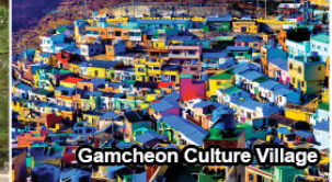
Gamcheon Culture Village