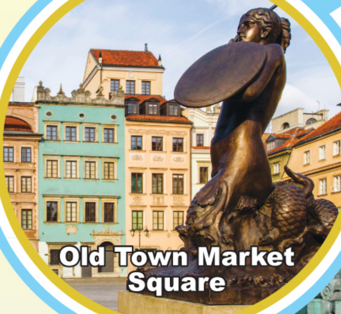
Old Town Market Square