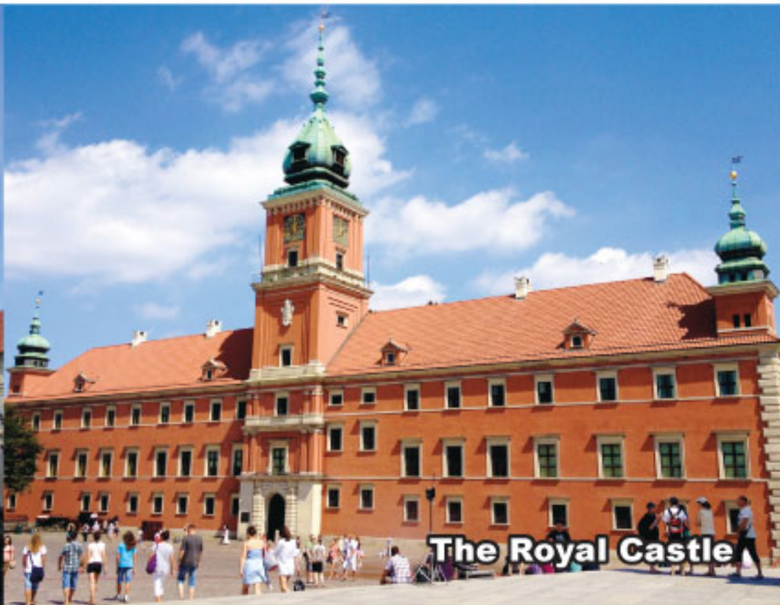
The Royal Castle