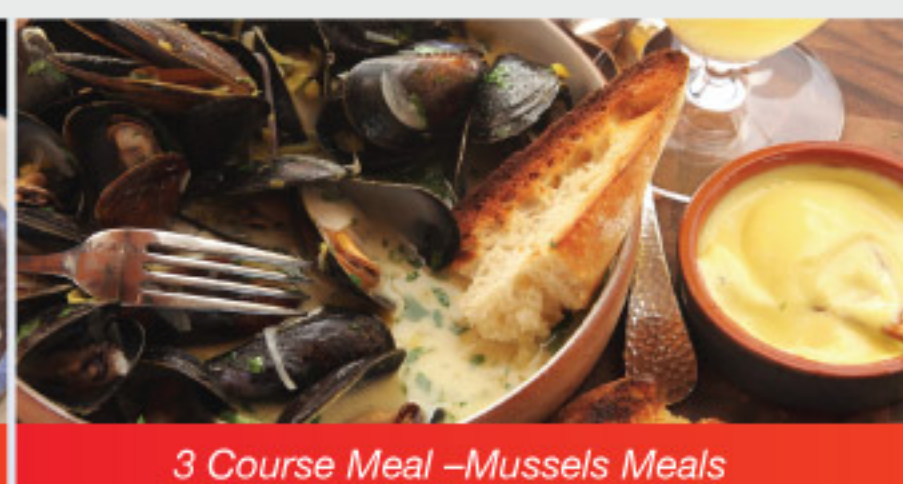
3 Course Meal –Mussels Meals