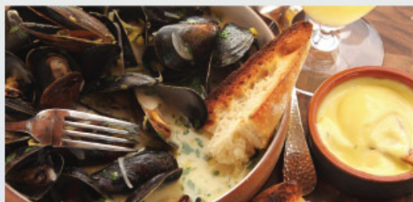
3道菜-布鲁塞尔 - 青口贝