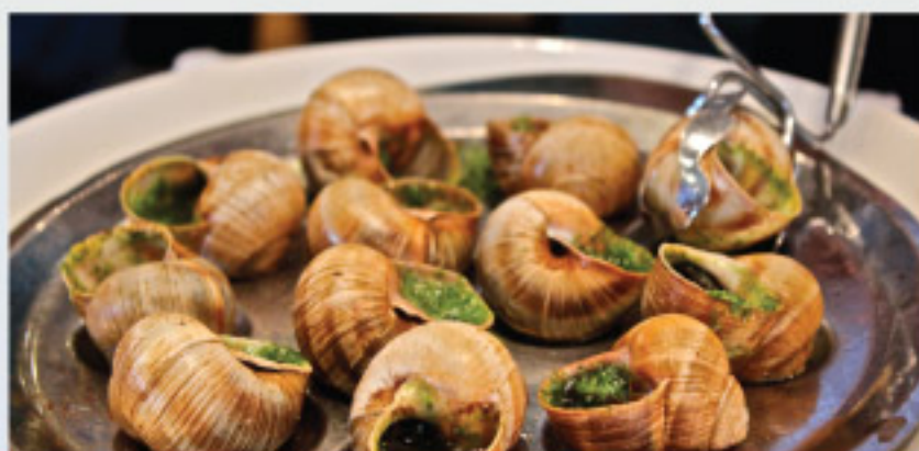
3道菜-巴黎 - 法國蝸牛