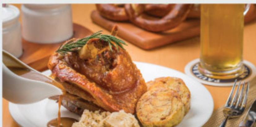
3道菜-滴滴湖 - 德国烤猪脚