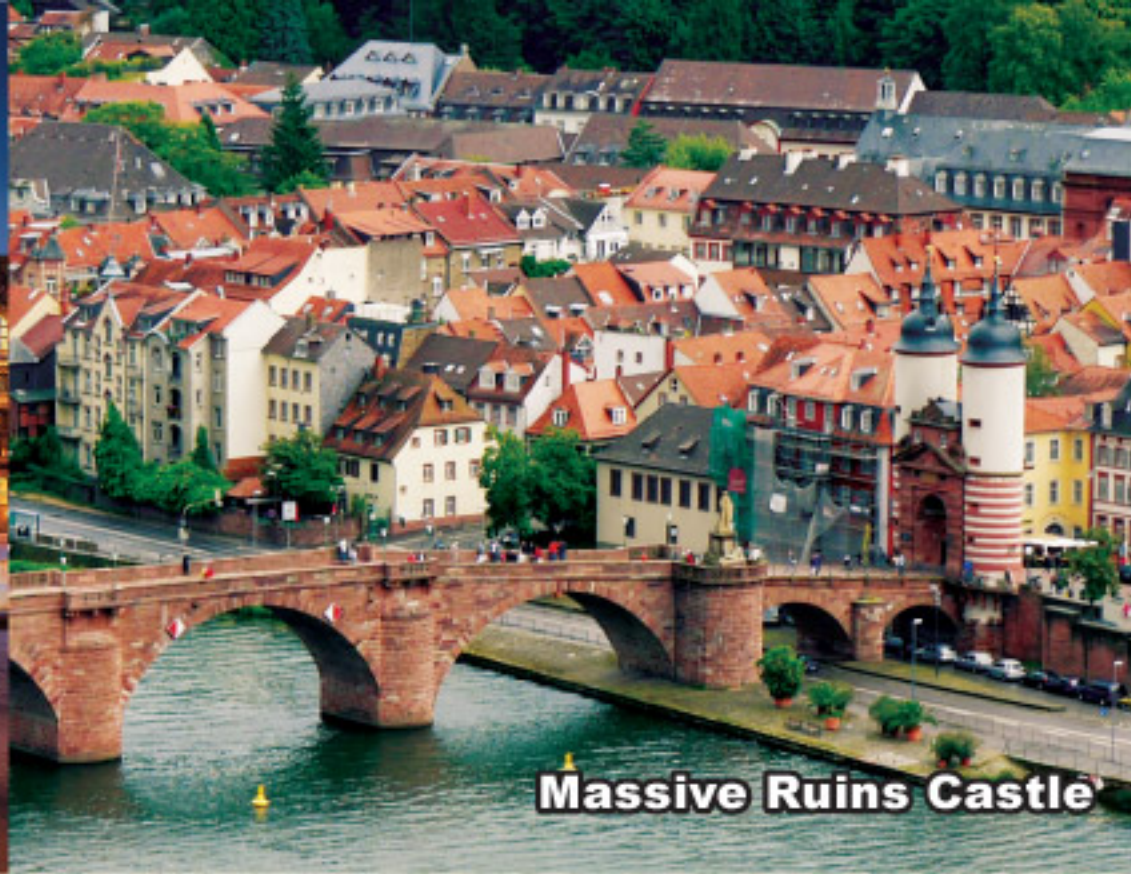
Massive Ruins Castle