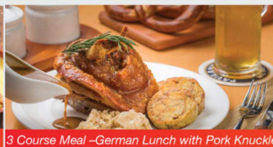
3 Course Meal –German Lunch with Pork Knuckle