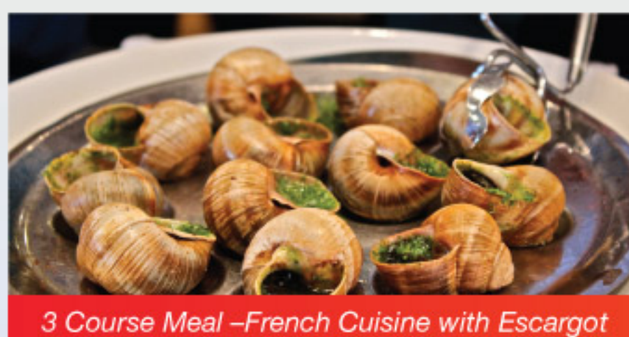
3 Course Meal –French Cuisine with Escargot