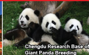
Chengdu Research Base of Giant Panda Breeding