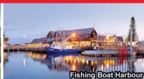
Fishing Boat Harbour