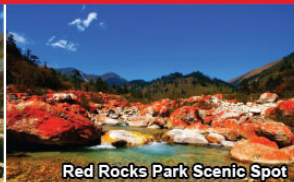
Red Rocks Park Scenic Spot