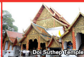
Doi Suthep Temple

Sequences of Itinerary are subject to local arrangement.