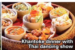
Khantoke dinner with Thai dancing show