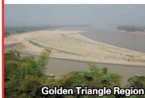
Golden Triangle Region