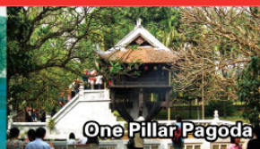
One Pillar Pagoda