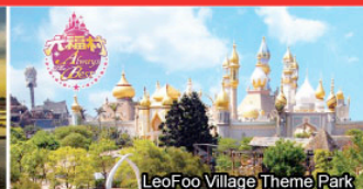
LeoFoo Village Theme Park