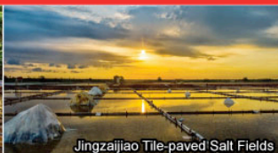
Jingzaijiao Tile-paved Salt Fields