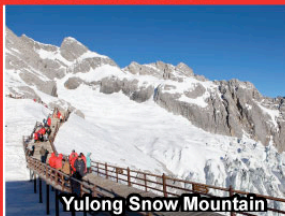
Yulong Snow Mountain