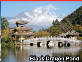
Black Dragon Pond