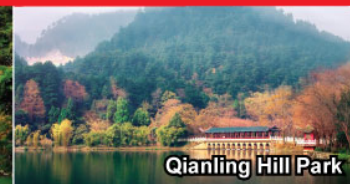
Qianling Hill Park