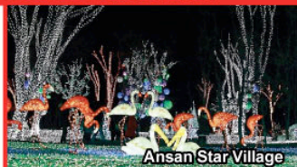
Ansan Star Village