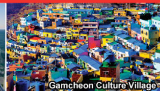
Gamcheon Culture Village